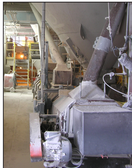
Figure 3. A 2-hp SE&A IEEE Plus belt conveyor motor (lower right of photo) that transports finely-ground product to the beneficiation department. It was one of the first copper-rotor motors installed during the current replacement program. The data plate lists the motor's NEMA nominal efficiency at 87.5%, one full percentage point higher than called for under NEMA Premium standards.

"We developed a list of motors we wanted to change out based on their efficiency," says Olcott. "Right now, we're concentrating on anything less than 90% efficiency. Some were built in the early 1950s, and some don't even have a nameplate because, in some cases, they were supplied by an