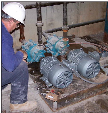
Figure 4. An electrician installs two new copper-rotor 10-hp SE&A IEEE Plus motors that will supply boiler feedwater for process steam. The SE&A motors are rated for a NEMA nominal efficiency of 92.4% at 100% load factor, which exceeds the NEMA Premium requirement by 0.7 percentage points. Tests conducted for CDA show that a copper-rotor SE&A motor of this size actually displays an efficiency of 92.72% at full load and greater than 93% at a 75% load factor.

In May 2007, replacement was proceeding as fast as possible, given the plant's continuous operating schedule. Examples of motors replaced as of that date include the blower motor shown in Figure 2 , a belt conveyor motor that transports material between the crushing to beneficiation departments ( Figure 3 ), a pair of boiler feedwater pump motors ( Figure 4 ), and about 15 more in sizes ranging from 1 hp to 20 hp. The current round of motor replacements was completed during a scheduled maintenance shut-down in mid-summer, 2007.